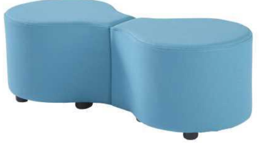
Clover-SEG H420 : W400 : D480