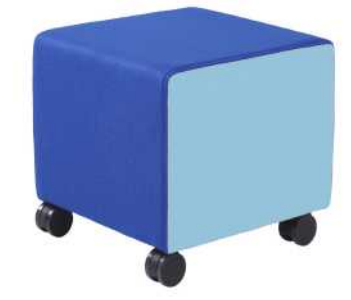
Clover-SQ H420 : W420 : D420