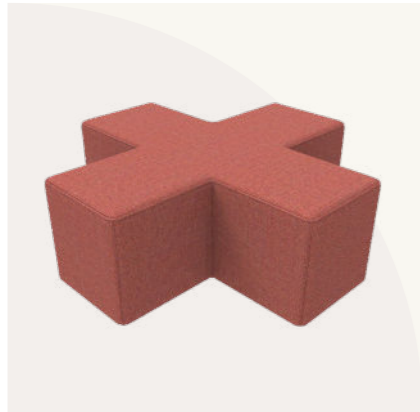
X unit L 1350, D 1350, H 450, SH 450