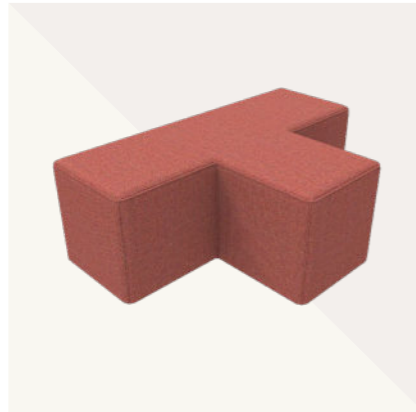
T unit L 1350, D 900, H 450, SH 450