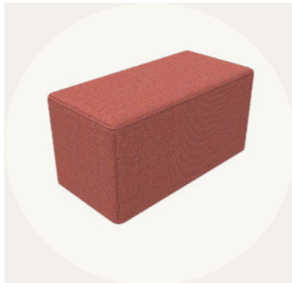
2 seat bench L 900, D 450, H 450, SH 450