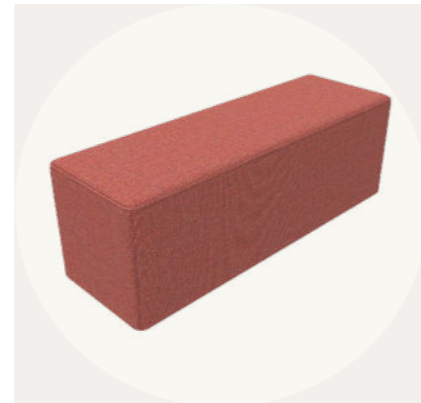
3 seat bench L 1350, D 450, H 450, SH 450