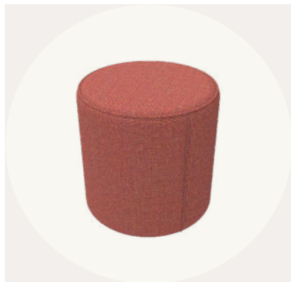
Drum DIA 450, H 450, SH 450