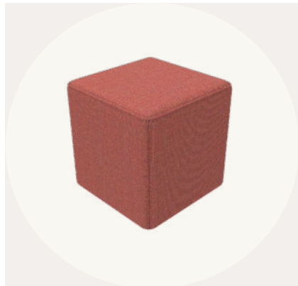
Cube L 450, D 450, H 450, SH 450