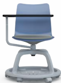
GC5B2 Mobile Chair with Storage with Writing Tablet Upholstered Seat Pad