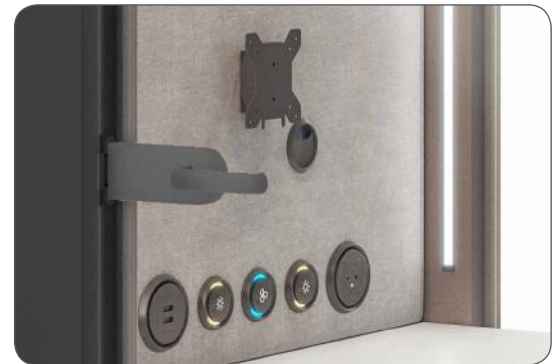
VESA mount / control panel / LED lights