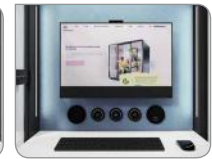
LED + VESA mount