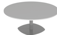
Mono Giant Table height 740 mm

SIZE (MM) ORDER CODE MFC 1600 dia MPG.160D 1800 dia MPG.180D