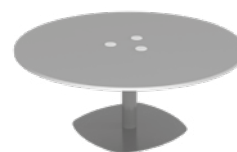
Mono Giant Table with Power (3 x Solo Power Units) height 740 mm

SIZE (MM) ORDER CODE MFC 1600 dia MPG.160D.SPG1 1800 dia MPG.180D.SPG1