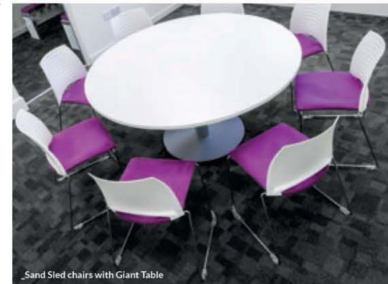
_Sand Sled chairs with Giant Table

5 Year Warranty Stock Item 100% Recyclable x40* Stackable