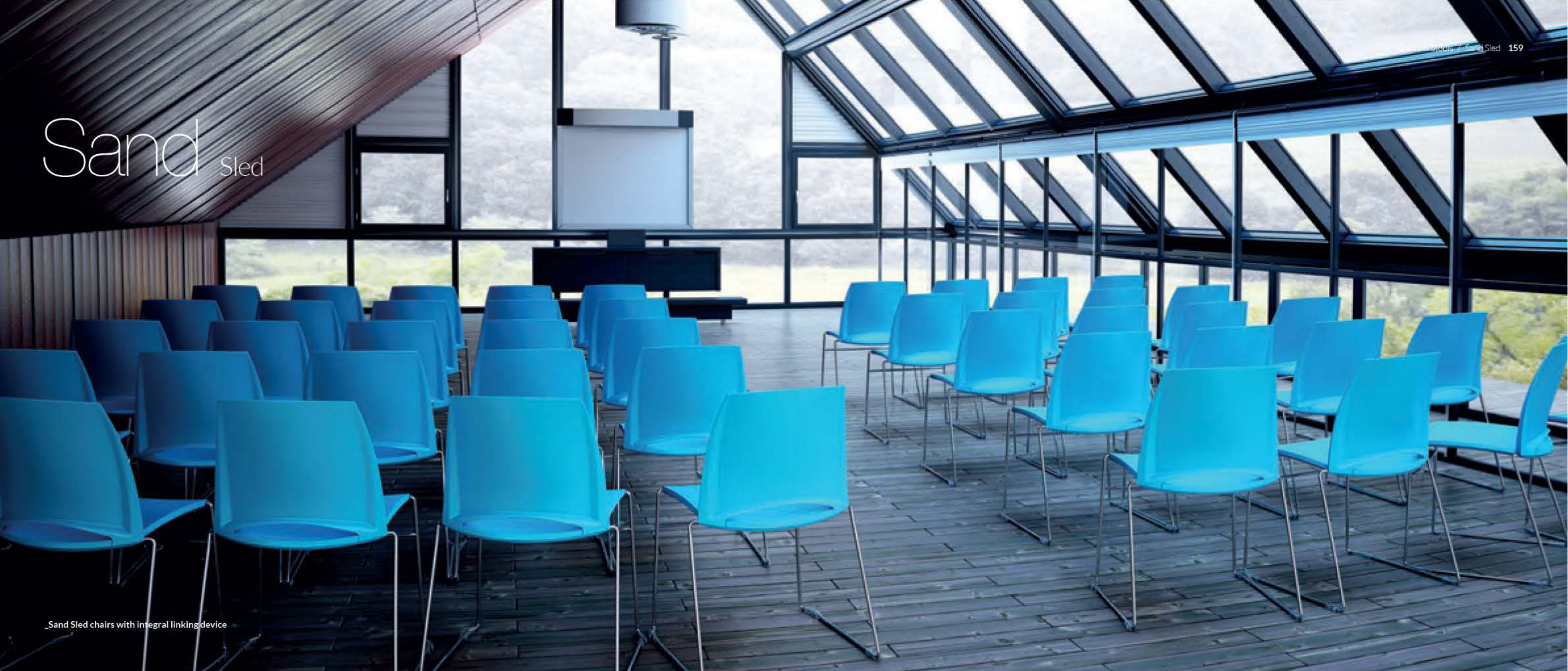
_Sand Sled chairs with integral linking device