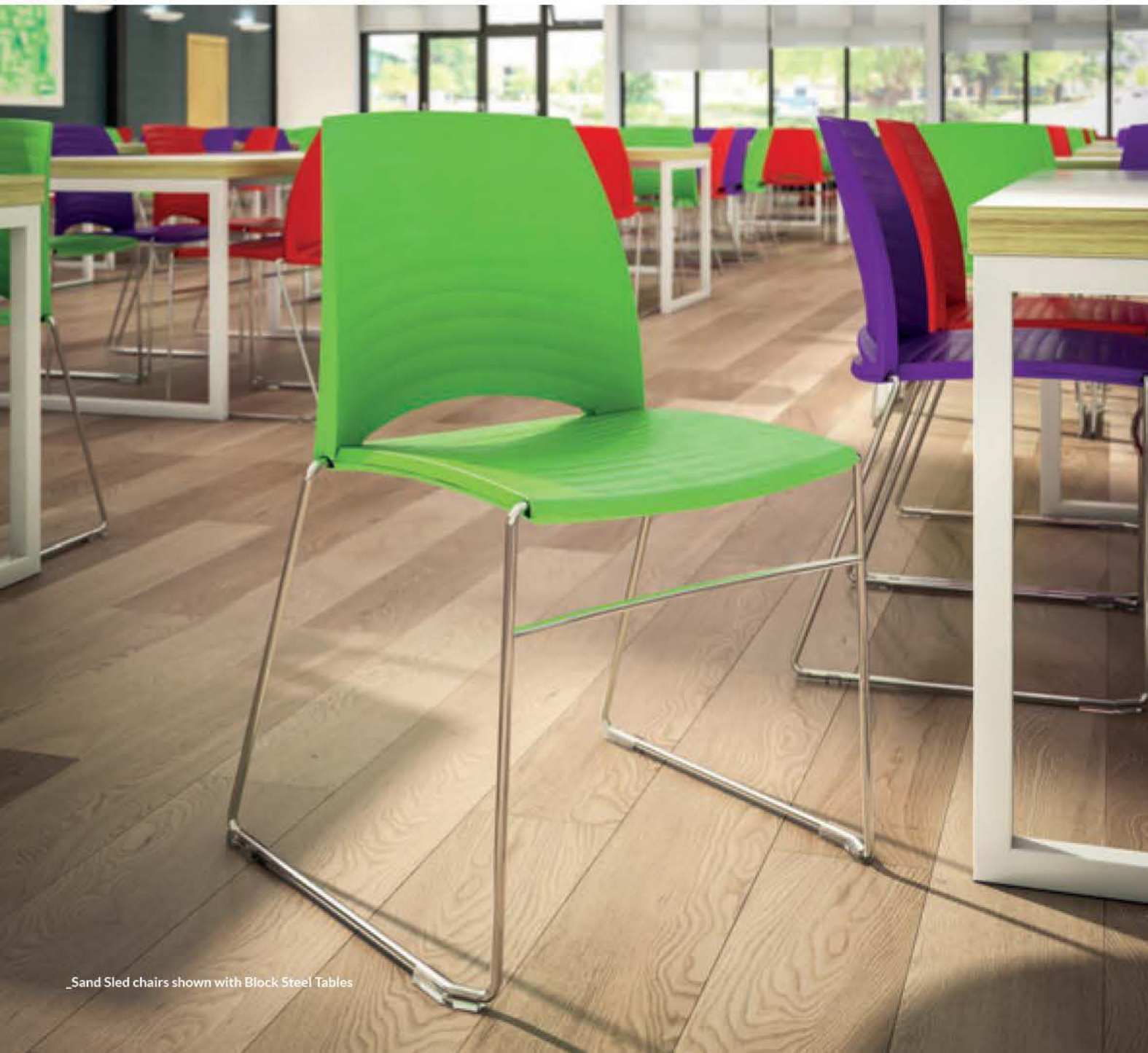
_Sand Sled chairs shown with Block Steel Tables