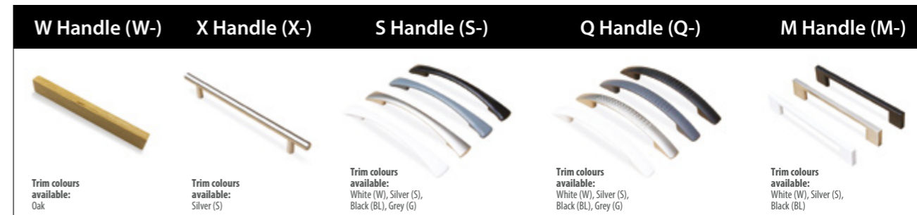
Trim colours available: Oak