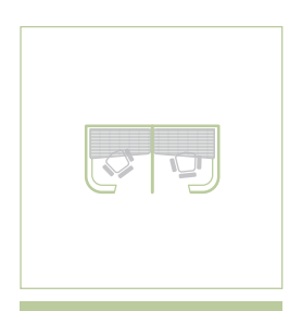
MP14-29 2 User Work Pod