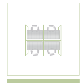
MP4-14 Large 4 Facing User Work Pod