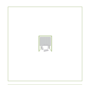
MP1-10 Small Single User Work Pod