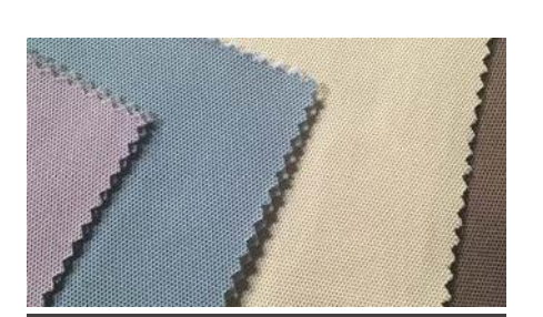
Camira Racer Band B Fabric

Blazer Lite is a finer version of our Blazer upholstery fabric. The felted, milled finish sports a colour palette consisting of melange mixes and plain shades, as well as subtle pastels and irridescent brights.