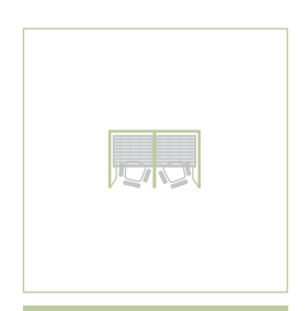
MP3-10 Small 2 User Work Pod