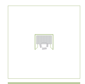
MP1-14 Large Single User Work Pod