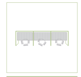
MP5-14 Large 3 User Work Pod