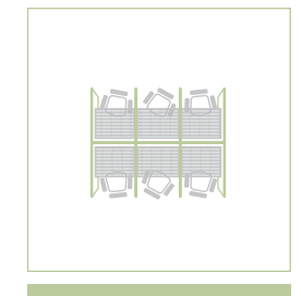
MP6-10 Small 6 Facing User Work Pod