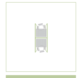
MP2-10 Small 2 Facing User Work Pod