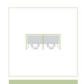
MP3-14 Large 2 User Work Pod