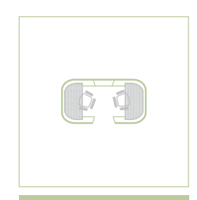
MP13-28 Two User Work Pod